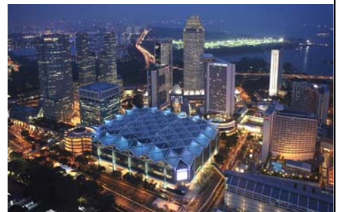
The Suntec Convention Center in Singapore will serve as the venue for the 2009 APEC CEO Summit

NCAPEC will be involved in organizing other events during the week, including US APEC Business Coalition