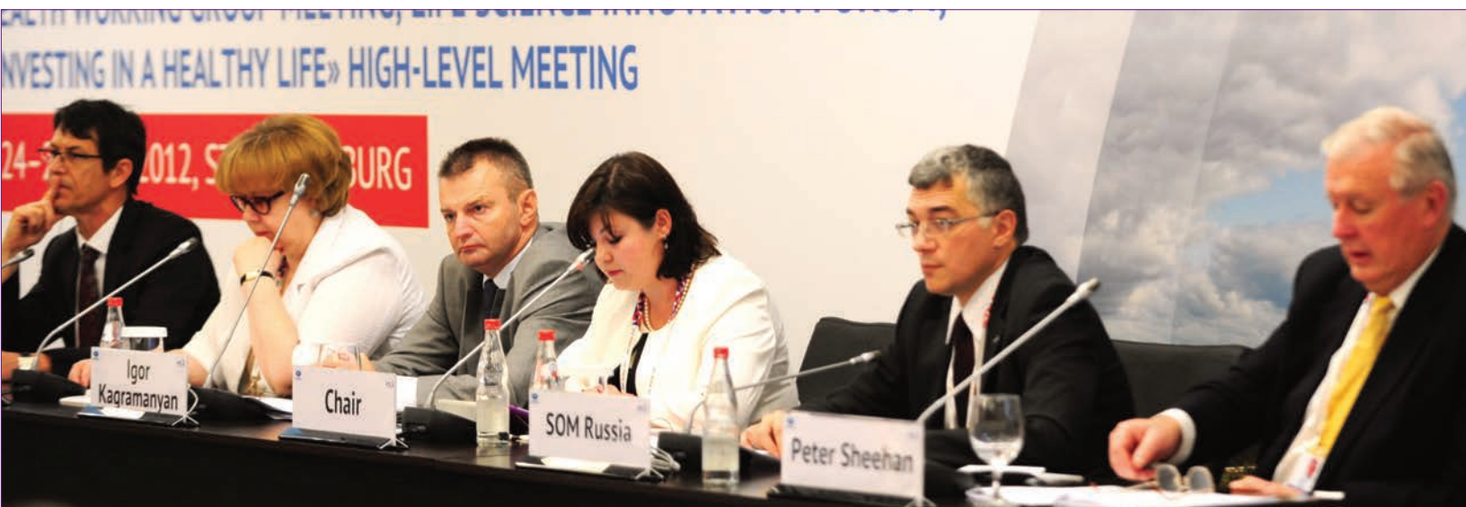
Participants engage in dialogue at the High Level Meeting on Health and the Economy, St. Petersburg, June 2012

Excerpt from APEC Leaders' Declaration, November 2011, Honolulu